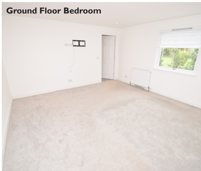
Ground Floor Bedroom